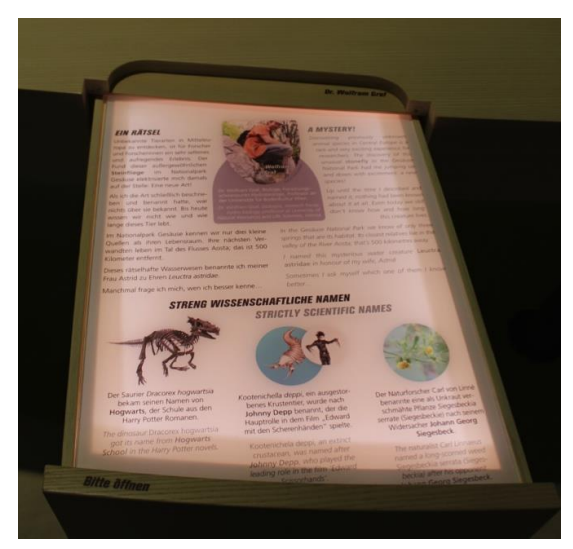
Figure 15: Cupboard referring to Wolfram Graf (NPGS, pic. 013, cropped)

The exhibition is based on a communicative approach in which the idea of story telling on the personal level is combined with the intention to construct an exhibition that enables visitors to experience a unique setting. Due to the very little amount of additional text, objects and explanations, it emphasizes visual as well as acoustic incentives on a new level. This combination creates, according to the homepage, a new type of listening experience (Nationalpark Gesäuse GmbH, 2015, own translation).