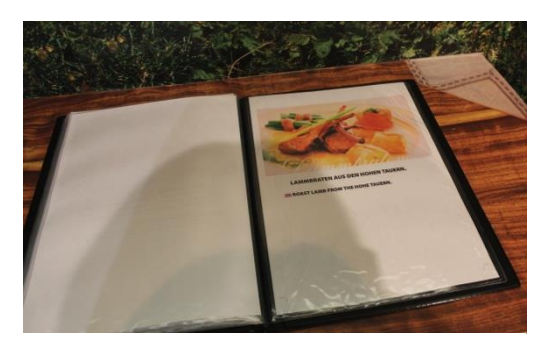
Figure 19: Menu in the section entitled "the alpine

rich flower biodiversity within the alpine landscape. The impact is thereby not only restricted to the landscape, but through breeding processes humans have also been modifiying animals in order to increase their ability to survive in these harsh mountain conditions (NPHT, pic. 147), which is also shown by explaining in detail the different species (NPHT, pic. 148-157). Animals are thereby described as tools (cf. NPHT, pic. 157) or "high-quality product[s]" (NPHT, pic. 158), which the menu shown (NPHT, summer" (NPHT, pic. 161) pic. 161, 162) illustrates this nicely.