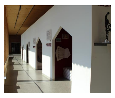
Figure 11: Section entitled "Mountain and People" (NPBG, pic. 200)

As already mentioned, the main exhibition is enlarged by a special exhibition, designed as four small huts referring to the relationship between people and mountains (NPBG, pic. 199, 200). It was created in cooperation with various local partners. Here, the focus is set on different aspects about the relationship like climbing, legends or certain famous local personalities. The content is thereby displayed with the help of images and sound installation, but is mainly based on objects and text (NPBG, pic. 221, 224).