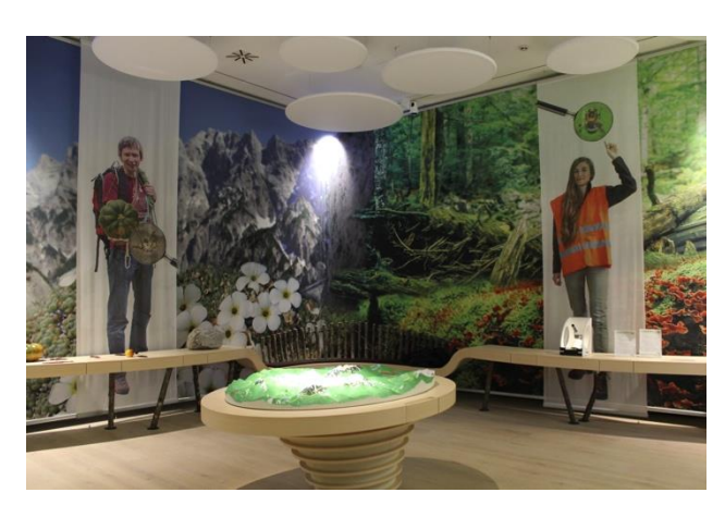
Figure 14: Exhibition "Passion for Nature", picture taken from the corner of the room (NPGS, pic. 029)

in 1846, and a student in our times about a recent discovery, the visitor gets introduced to the exhibition "passion for nature" (NPGS, pic. 036). Further on the right side, general information about the park is also displayed, relating to the landscape, the possibility to experience nature and the visitor centers within the park (NPGS, pic. 037).