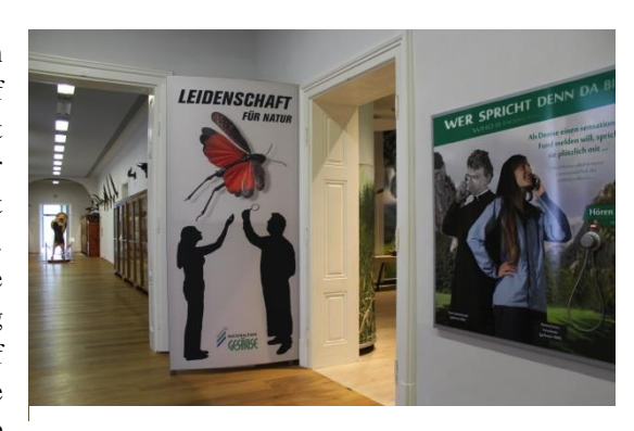
Figure 13: Entrance to the exhibition "Passion for Nature" (NPGS, pic. 038)

The exhibition is located in approx. 8 km distance of the park. One particularity of this exhibition is that the permanent exhibition is integrated within another museum with a totally different background, approach and design. Indicating this separation between the different sections is thus the aim of a big banner placed next to the entrance door of the exhibition (NPGS, pic. 038) and the short introduction on the wall next to the door. With the help of a simulated phone call between the former padre Strobel, born