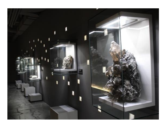
Figure 18: Part of the section "treasure chambre" (NPHT, pic. 101)

This perception changes when linking this statement with another section in the exhibition: the treasure chamber (NPHT, pic. 086, 100). Referring to "gorgeous (NPHT, crystals" pic. 095), attractiveness (cf. NPHT, pic. 098) or famousness (NPHT, pic. 099) portrays a different perspective on the term "treasure", especially in combination with the manner of presentation (NPHT, pic. 101), in which they appear as precious objects, protected by glass, illuminated by a special light installation. Above all, the inclusion of the mining history within the area illustrates a