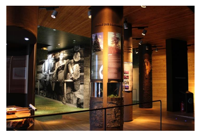
Figure 17: Section "Forestgallery" with the section "Alpine summer" in the background (NPHT, pic. 123)

The next section is called alpine summer and links to the alpine pastures. Green grass wallpaper covering the whole exhibition space, from ground to ceiling, marks this section (NPHT, pic. 144). A wall placed in the middle of the section with pictures of people in the high pasture setting separates this station into