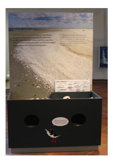
Figure 5: Section entitled "The drift line", pictures taken from different angles (NPHWS, pic. 213, 214, 215, cropped)

The reason for this is that due to the arrangement, the boundary is not only drawn with the help of language, but rather also expressed by the spatial setup. On opposite sides of a wooden construction, two aspects of the driftline are presented. On the one side, the "treasures of the sea" (NPHWS, pic. 213) refers to objects from the underwater world, like seashells, quills or other dried remains of animals and plants. The visitor is able to touch and explore the different objects and even identify them with the help of some further descriptions. The intention is, as stated within the written description, to mirror the high biodiversity of animals living in the wadden sea (NPHWS, pic. 213). This side of the construction doesn't contain any direct link to humans, human activity or influences (apart from encouraging the visitor to engage with and identify the displayed species).