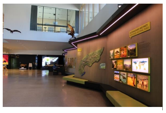
Figure 8:Right hand side of the Foyer, picture taken from the entrance (NPBG, pic. 005)

The display of information starts in the foyer, where different aspects about the NPBG and its relevance for national international networks and presented (Nationalparkverwaltung Berchtesgaden, 2015). The displayed information is thereby based on text, images and maps (NPBG, pic. 025, 026). Apart from the open cinema across the entrance (NPBG, pic. 005), it also includes an interactive station, putting the visitor into the role of the park manager who has to decide how