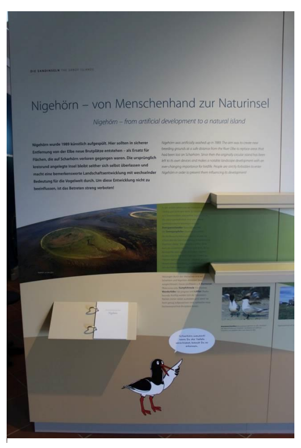
Figure 4: Section entitled the sandy islands, with the discription of Nigehörn and the small booklet (NPHWS, pic. 114)

However, a line is still drawn between the human made construction of the island at the beginning and its further development discribed as natural. This understanding goes hand in hand with the described nature protection vision of the biosphere reserve, stresses the need for which "process protection" (NPHWS, pic. 193, own translation). According to the exhibition, the main aim within the core zone is to allow the typical dynamics within the different habitats to develop. As long as the natural flow is ensured, the origin is apparently unimportant for its understanding as natural site.