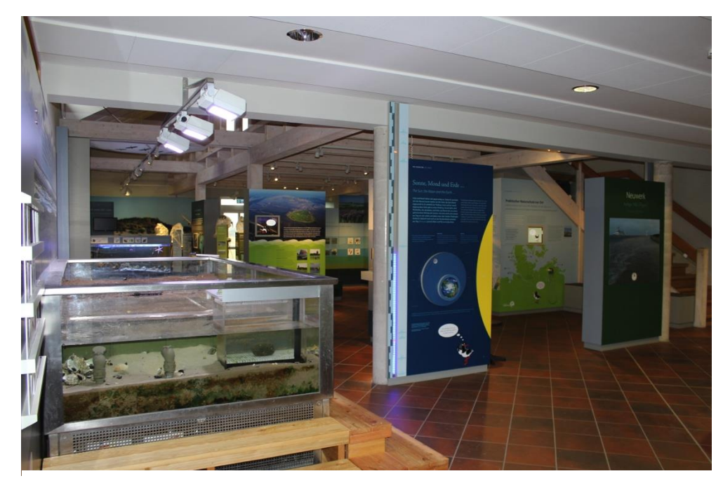
Figure 2: Exhibition NPHWS, picture taken from the entrance (NPHWS, pic. 203)

The structure of the exhibition of NPHWS is mostly based on the different features within the NP, as the 13 headlines on the top of the boards indicate. Four of the thirteen sections are dedicated to specific habitats: salt marsh (e.g. NPHWS, pic. 080), tidal creek (e.g. NPHWS, pic. 032), intertidal mudflats (e.g. NPHWS, pic. 006) and dune (e.g. NPHWS, pic. 044). Two other topics relate to a certain category of animals: birds (e.g. NPHWS, pic. 068) and marine animals (e.g. NPHWS, pic. 129).