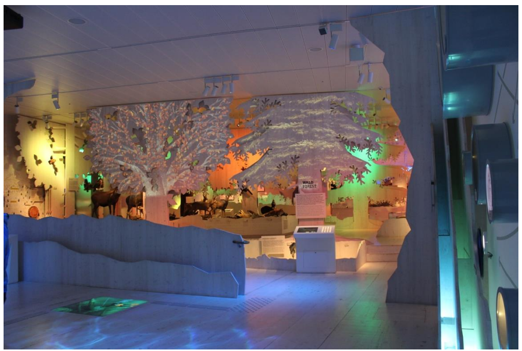
Figure 9: Exhibition "Vertical Wilderness", picture taken from the entrance (NPBG, pic. 052)

The 1,000 m<sup>2</sup> permanent exhibition is based on the simulation of a walk through the four main habitats of the park, simulated by the interplay between wooden constructions and a sound and light installation (NPBG, pic. 046, 052).