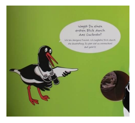
Figure 3: The mascot Freddi (NPHWS, pic. 001, cropped)

In contrast to that stands the communication pattern of Freddi (e.g. NPHW, pic. 001), an oystercatcher that functions as mascot of the NP. He communicates directly with the visitors and encourages them to "try out" (NPHW, pic. 024, 046, own translation), "to touch" (NPHW, pic. 133, own translation), or to "not come closer" (NPHW, pic. 85, own translation) to the animals during the breeding season. As can be seen, he is directly addressing the visitors, encouraging them to get engaged with the object, asking questions, giving advice and explaining phenomena. Since Freddie is a talking bird, this meta-communicative pattern as well as the contrast to the other writings within the