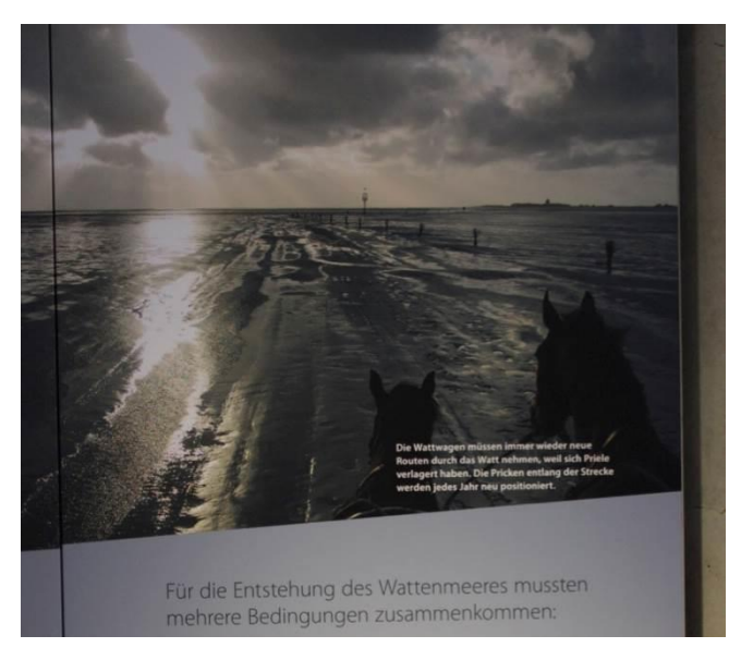
Figure 6: Picture of the trail through the Wadden Sea (NPHWS, pic. 016, cropped)

However, it is important to notice, that there are also evidence illuminating the possibility of humans living in balance with nature. For instance, in the part referring to the biosphere reserve, a sustainable human business in harmony with nature is described (NPHWS, pic. 189, 190).