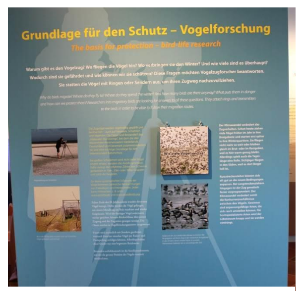
Figure 7: Section entitled "The basis for protection - bird-life research" (NPHWS, pic. 069)

Apart from the negative image of human activity, there is one frame, which also underlines the whole exhibition: human as researcher. In a way, the style of information in general illustrates this influence: many drafts, numbers and categories (e.g. NPHWS, pic. 135, 137) in order to present animals, as well as stating the German, English and Latin name of every species (NPHWS, pic. 009), which is a common approach within the scientific world.