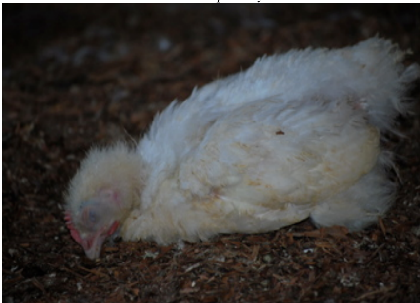
Picture 1. Sick chicken with acute respiratory distress.

Are often subclinical but mild respiratory signs and a small drop in egg production can be seen. No nervous signs and mortality is usually negligible.