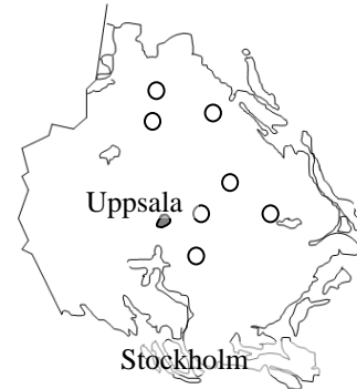
Figure 2. The stands are marked as circles in the map of Uppland.

At high FWD-amounts of at least 10 objects in a few squaremetres, every fifth object was measured for environmental and substrate variables and the rest only for species.