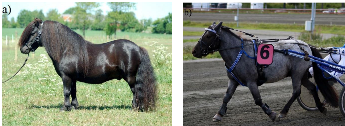
Figure 2. Shetland ponies destined to different uses (a) Showing stallion. (b) Harness racing gelding.

Owing to its island existence the pony has evolved with relatively few importations and those that did arrive were by necessity, owing to the difficulties of transportation by sea. Two significant types established themselves within the breed: the heavier boned animal with a longer head and the lighter one, with high tail carriage and small, pretty head. The two types remain established to this day and retain their distinct characteristics. The heavier boned draught animal, with powerful chest and shoulders, is mainly used for leisure driving of carriages and showings, while the lighter, free moving pony for is most commonly used for riding and in both trotting harness-racing competitions and gallop races as well (Figure 2). (The Shetland Pony Stud-Book Society, 2017; Sveriges Shetlandssällskap, 2017).