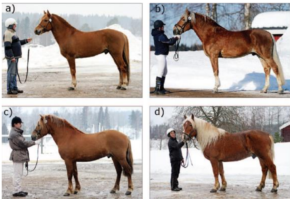
Figure 1. Finnhorses of different types. (a) Trotter type. (b) Riding horse type. (c) Miniature type. (d) Draught horse type.

Nowadays, the Finnhorse is bred to be either a trotter, a riding horse, a work horse or a pony-sized horse (Figure 1). The horse should be typical of the breeding line into which it is being introduced in the studbook; however, breeding between lines is allowed and the resulting progeny can be registered as either of its parent's type in the stud book. The aim of the studbook is to direct breeding towards well performing, multi-purpose horses abiding by the breed description that are easy to handle, good in movements, tenacious and healthy (Hippos, 2017).