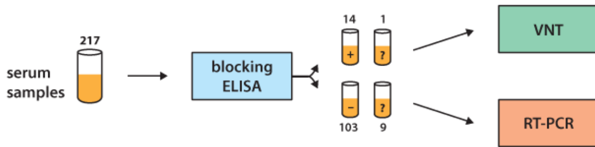
Figure 2. All 217 serum samples were analysed by blocking ELISA. Fifteen selected samples with a positive or doubtful result from the ELISA were analysed by VNT, and 112 samples with negative or doubtful results from the ELISA were analysed by real-time RT-PCR.