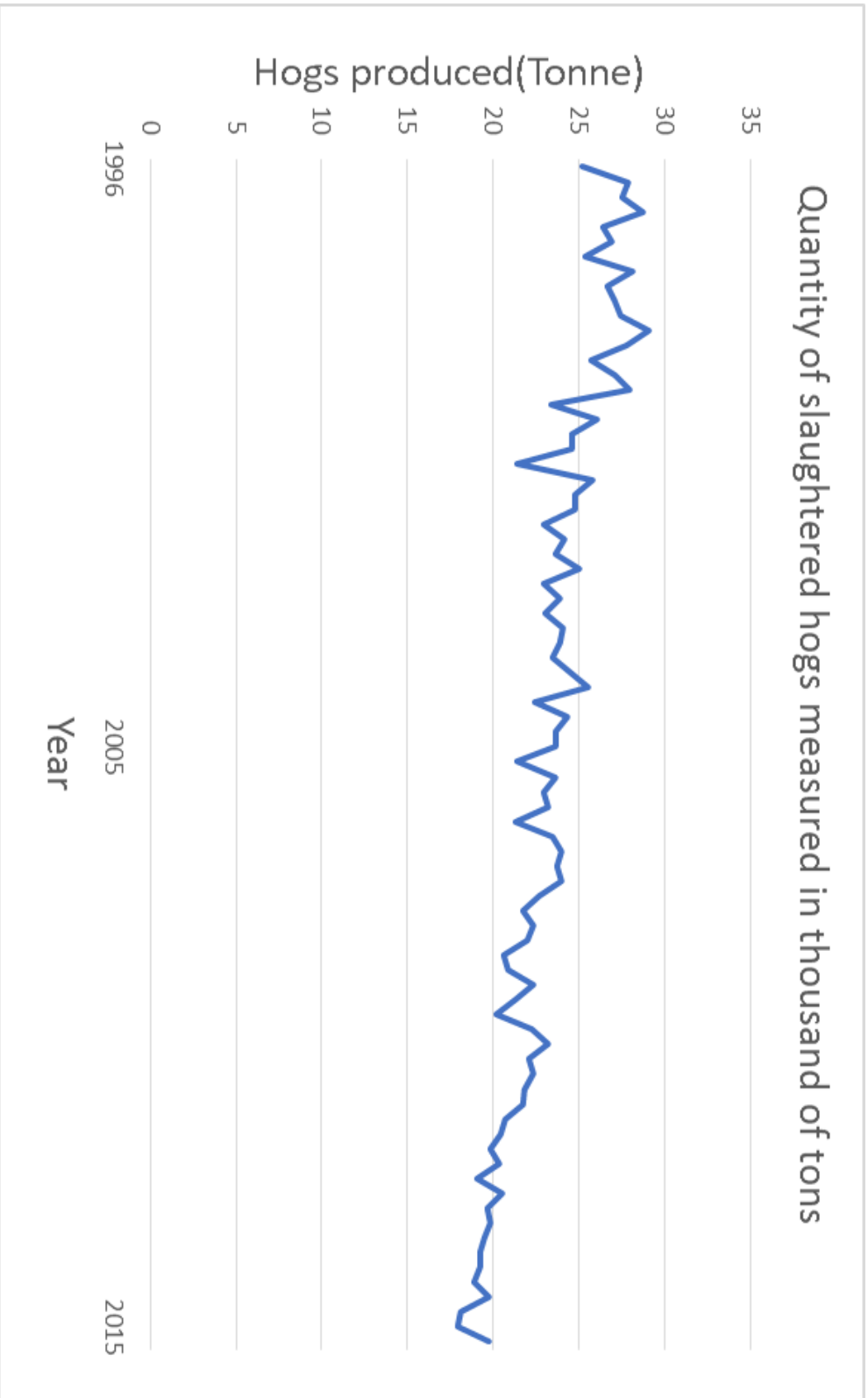
Graph 2 shows the aggregated supply over the last 20 years, unit thousands of tons