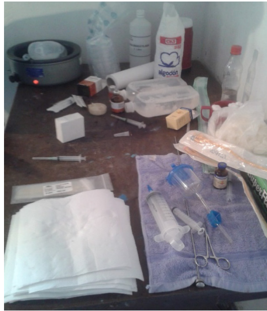
Fig 4. Left: Llama embryo grade 1. Right: Some of the equipment used.