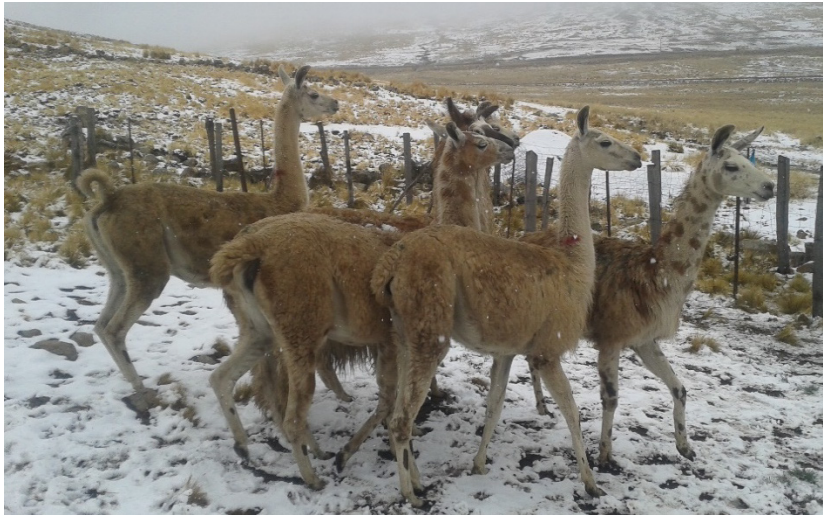
Fig. 1, A group of llamas of kara phenotype a snowy day on the Peruvian Altiplano.

phenotypes, the Kara has less fleece on the neck and head whereas the Chacko is woolly on the neck, ears and head (Fig.1). Llamas can be multicolored, with coloration ranging from white to black and brown. Fleece quality is uneven and there is a wide variation of fiber diameter. The llama is considered to derive from the larger of the two wild SACs, the guanaco ( Lama guanicoe ). It is possible that two types of llama existed before the Spanish conquest, one kind with uniform color that was used for textiles and another breed that was a beast of burden and meat producer.