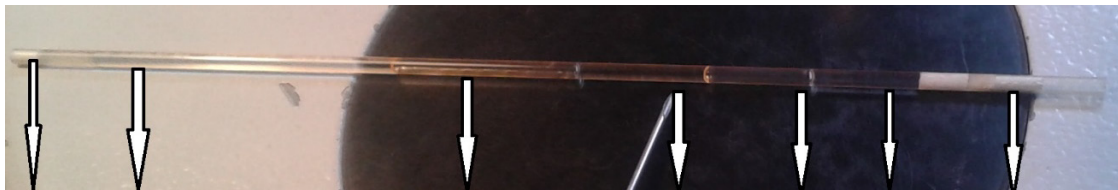
Fig 5. Embryo transfer straw containing cotton, holding medium, air bubble, holding medium with the embryo, air bubble, holding medium, polyvinyl alcohol.