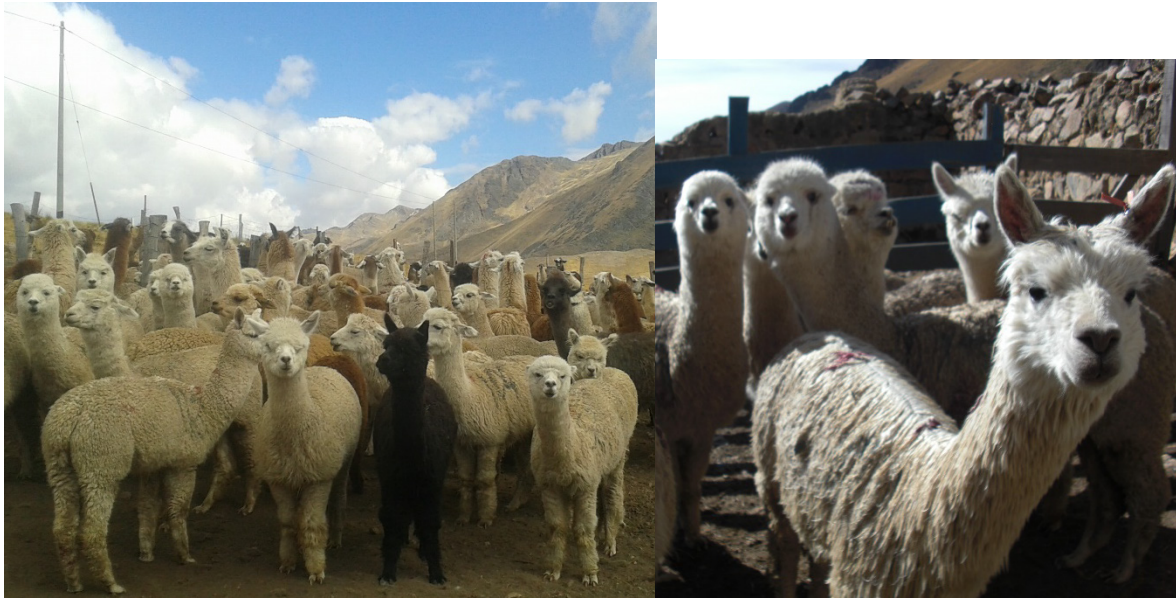
Fig. 2. At the Right; A group of female huacaya alpacas with llamas and Andean peaks in the background. At the Left; a suri alpaca