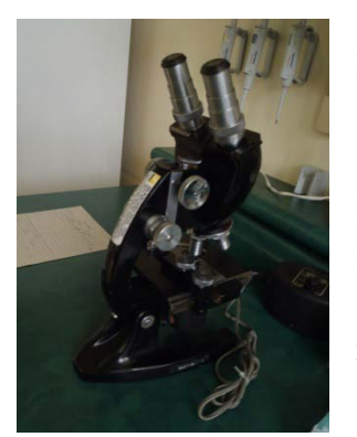
Fig 3. Dark-field microscopy used at UNMSM.

MAT is considered the standard method for the serological diagnosis of leptospirosis (Levett, 2001). To execute MAT leptospires are grown in liquid media (Figure 2). Serum is mixed with the leptospires in order to test for agglutination. Agglutination indicates that the serum contains anti- Leptospira antibodies (Picardeau, 2013; Sykes et al., 2011). Antibodies are detectable from 5-7 days after infection