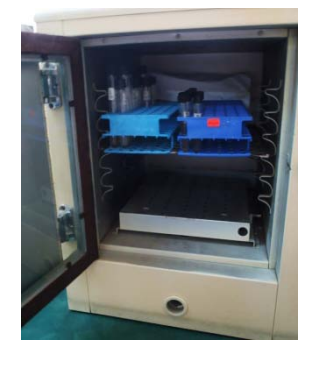
Fig 2. Incubation of leptospires.

(Levett, 2001). In a study by Limmathurotsaku et al. (2012) in humans, the sensitivity of MAT was found to be around 50% and the specificity almost 100%. As the leptospires are thin and small, dark field