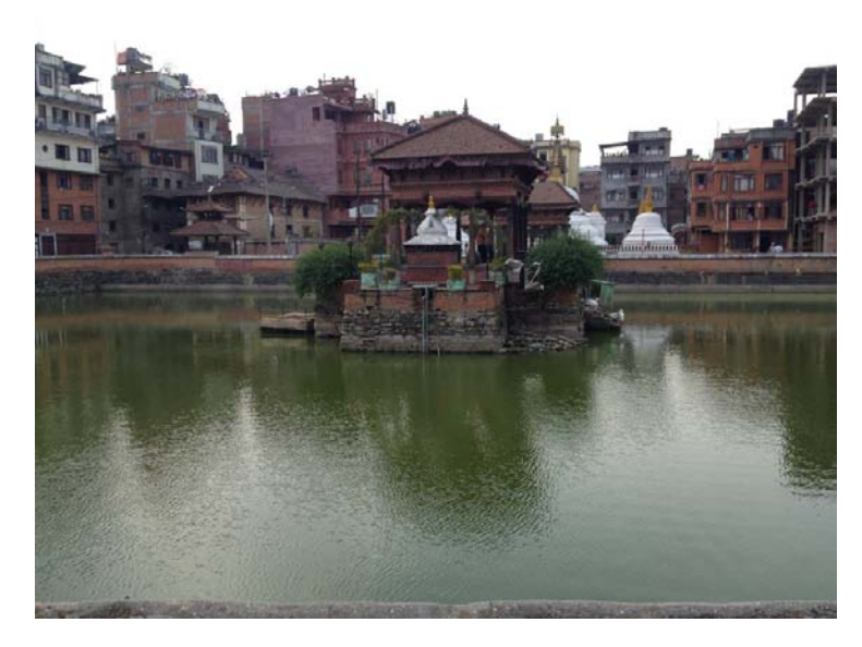
Image. Example of least preferred setting, Pimbahal Pokhari, Lalitpur; The setting features large body of water, however, the setting is characterized by dominating built influences (which is also reflected in the surface of water), lack of vegetation and poor water quality (surfacial foams and algae).