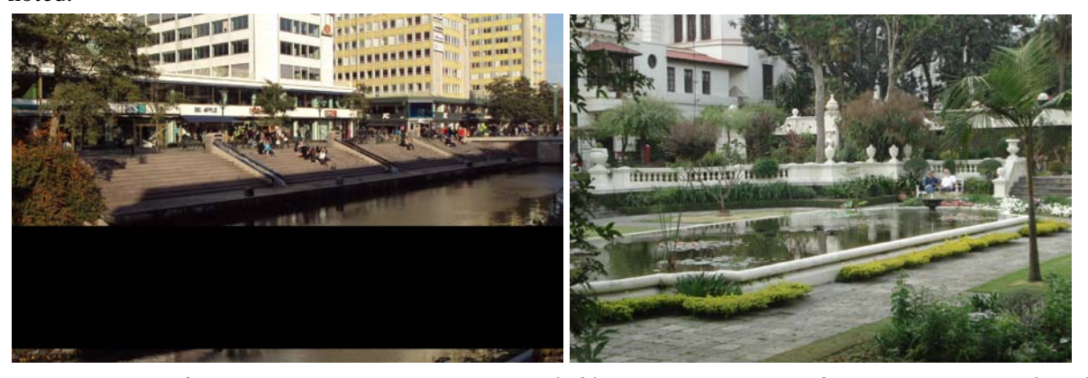
Images: Most preferred settings- water canal at Malmo(left) and pond at Garden of Dreams, Kathmandu(right).

One of the noticeable observations was the presence of large number of young people probably in their 20s and least presence of older people on the settings associated with the water canal in Malmö. Similarly, in Balaju Water Park in Kathmandu, it was worth observing that old people prefer staying away from any form of water features present within the site. The least presence of family groups near or around places with water features in Swedish sites was also a fact to be noted.