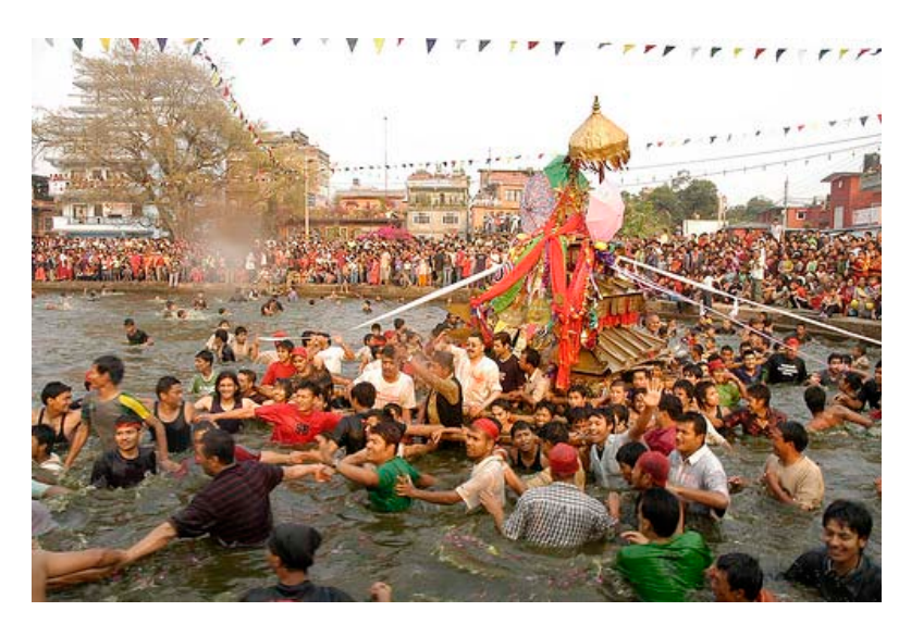
Image . Photo exhibiting celebration of a traditional festival 'Hadigaon ko Jatra', Hadigaon, Kathmandu, Nepal.

Water, in many cultures is revered. In Hindu culture, water is associated with holiness, a sacred element that can cleanse and purify your body and soul. Hindus believe that by simply taking a dip in holy rivers like Ganges one can get redemption from all the sins committed. Water is also used as a sacred element in their traditional rituals. They also believe, sprinkling holy water (called 'jal') in the living spaces and one's surroundings help to drive away evil and negative forces. Drinking such 'jal' is believed to foster health and vitality. Similarly, in religions like Christianity, Judaism and Islam, water is associated literally and symbolically with significant events in human life—baptism (in Christianity), immersion of the body in a water pool before marriage (Judaism and Islam), and purification of the dead body before burial (Burmil et al., 1999). Water and Water bodies in many cultural festivals have significant roles—in Kathmandu, a famous festival generally called as 'Hadigaon ko jatra' is celebrated in a traditional pond where devotees look for an ornament belonging to a god which as a myth is believed to have been lost in the same place.