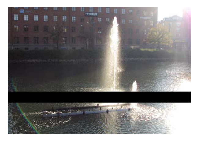
Image. Fountain adding sound and freshness—the fountain was controllable by pressing a botton; in Malmö.

mitigated unpleasant sounds. The importance of animating small ponds was found to be more important as they usually get dirty and stagnant quickly without the aid of motion.