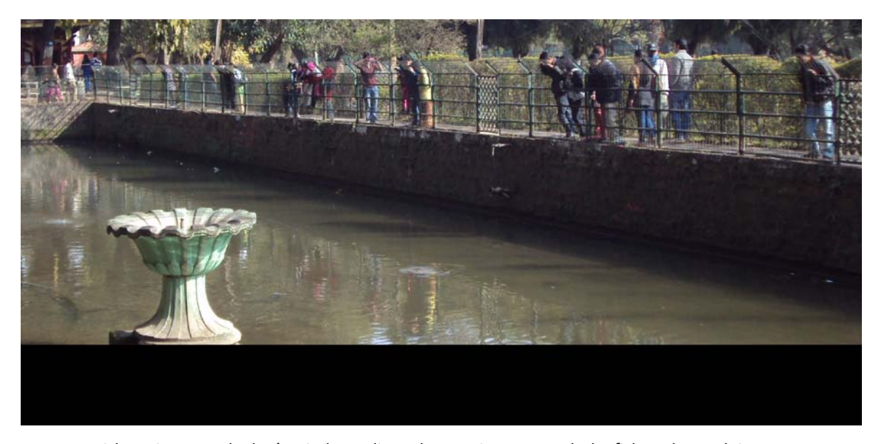
Image. Fish gazing- People don't mind standing a longer time to watch the fishes play, Balaju Water Park, Kathmandu.

holds the people in the area for a longer time. Again, children were seen to be specifically fond of fishes both in the Nepalese and the Swedish context. In Balaju Water Park, it was notable to see people observing fishes in a pond through a meshed wire standing for considerable amount of time and also taking pictures. Similarly, in Siddhi Pokhari located in Bhaktapur, people were seen to derive joy from feeding the fishes.