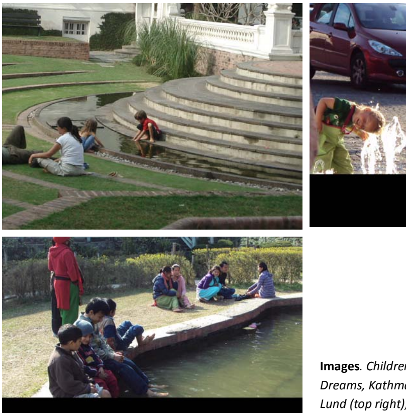
Images. Children playing with water at garden of Dreams, Kathmandu (top left); in a square in Lund (top right); children dangling their legs in the pond at Balaju Water Park, Kathmandu, Nepal (bottom left).

In my entire observation both in Nepal and Sweden, I have found children getting hypnotically attracted to water. I have encountered many sights where children being carried by the elders, points towards water source as a gesture to take them near it. Children were found to be very curious about water—they all the time try to touch it or simply give a long gaze (as if they were literally hypnotized).