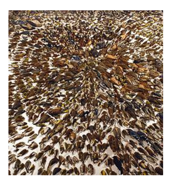
Picture 2. Birds killed by collision with buildings in Toronto, Ontario. Collected by volunteers in 2009.

tating to a huge flock of birds in the vicinity at a foggy, cloudy or rainy night. IDA also presented reports on extreme weather conditions, which show that more than five thousand warblers and other birds were killed during two nights in September 1968, by collision with a television tower in Nashville, USA. Another extreme report estimate that fifty thousand birds were killed during two nights in October 1954 at Robins Air Force Base, Georgia, USA.