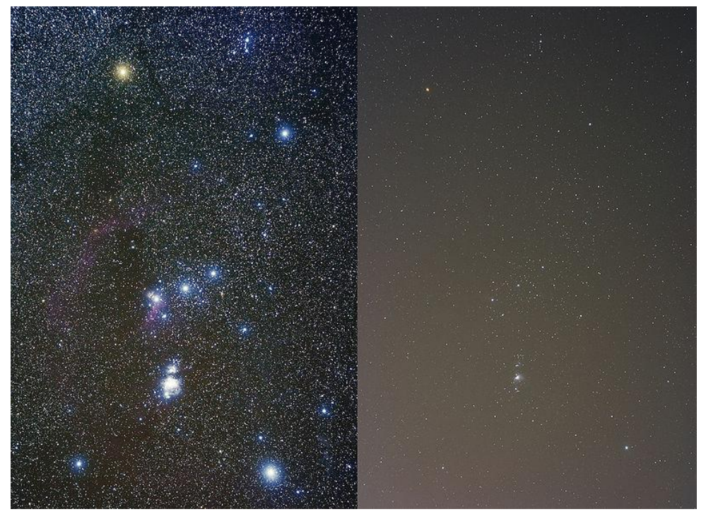
Picture 4.The constellation Orion: To the left from dark skies and to the right within the urban area of Utah, USA. Wikipedia.

Scientists in the documentary The City Dark (2011) mean that the evolution of mankind is characterized by the presence of the starry sky. A starry night sky can evoke evolutionary questions, whimsies and wonders that are important for human beings. The absence of a truly dark starry sky can have unknown influence on the further evolution of mankind. IDA (2012) predicts that when the view eventually fades, the interest to preserve the dark night is likely to dim as well. Few people will then realize the magnificence of what is lost.