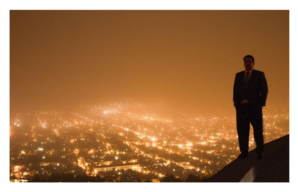
Picture 1. Sky glow over San Fransisco.